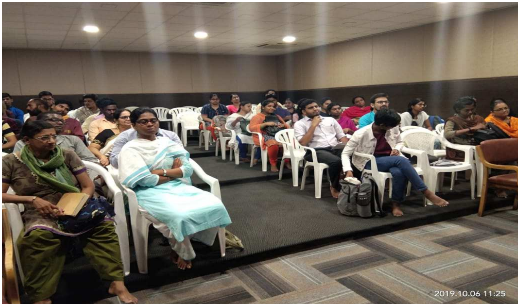
Learners at 25160 SSS Jain College attending Induction Meeting