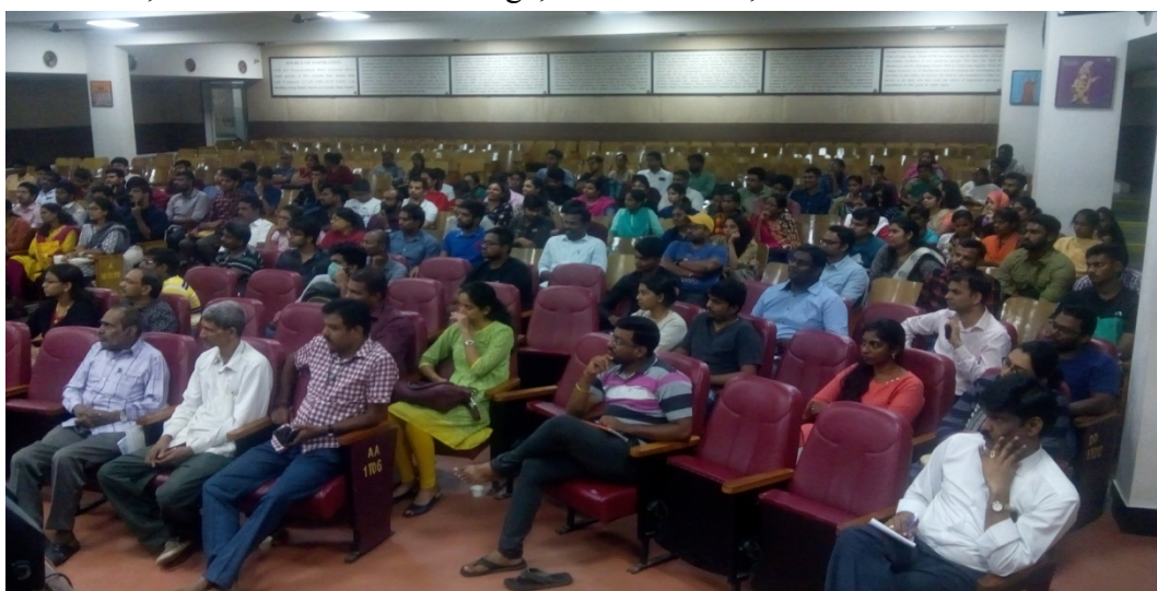
Learners attending Induction Programme at LSC-2501 DDGD Vaishnav College, Chennai