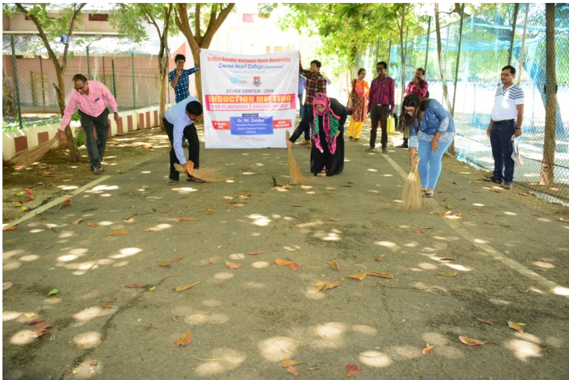
Learners of 2509 involved in Swachhta Programme during Induction Programme