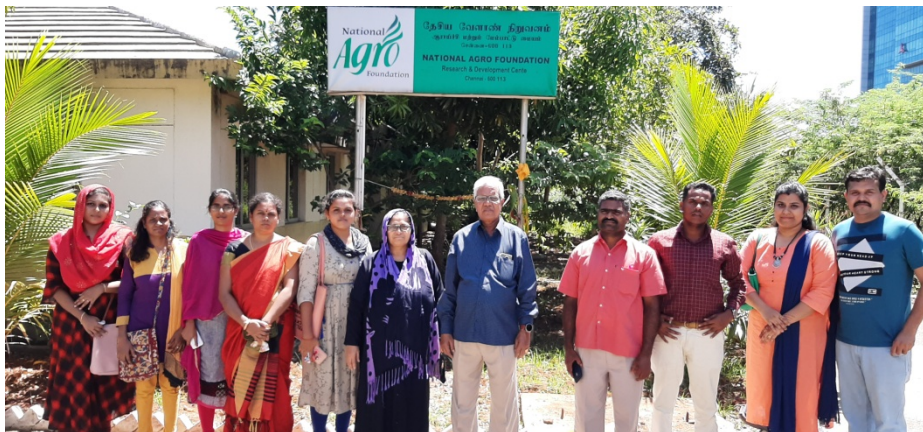
Induction Programme at LSC-25219 National Agro Foundation, Taramani