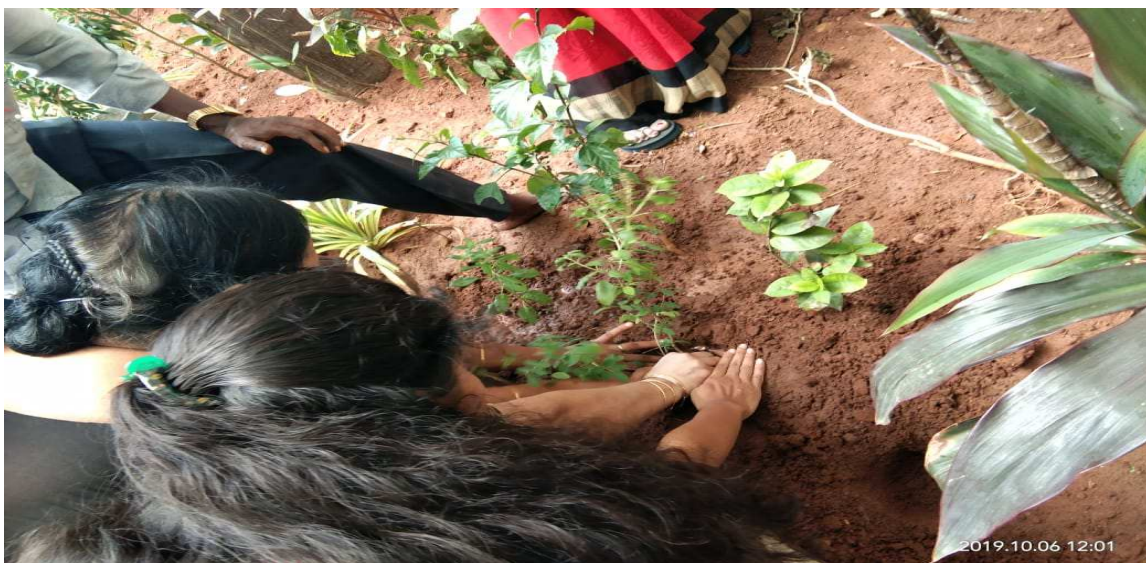
Learners attending Plant a Tree Programme at LSC-25160, SSS Jain College, Chennai along with Induction Programme