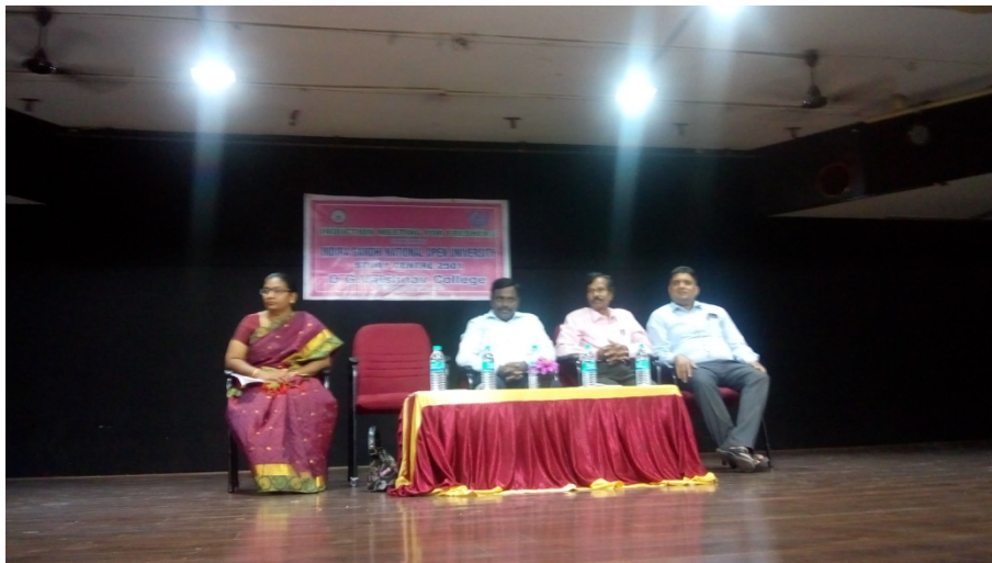
Induction Programme at LSC-2501, DDGD Vaishnav College, Chennai