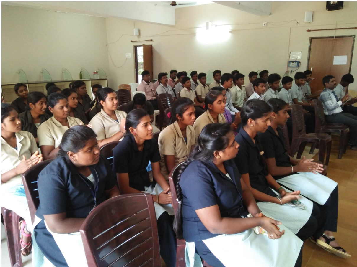
Learners attending the Induction Programme at LSC-2534 Er. Manimekalai Polytechnic, Hosur

On 12-10-2019, Induction Programme was organized at LSC – 2508, AVC College, Mayiladuthurai.