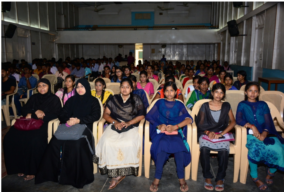
Learners of LSC-2509 Sacred Heart College, Tirupattur attending Induction Programme