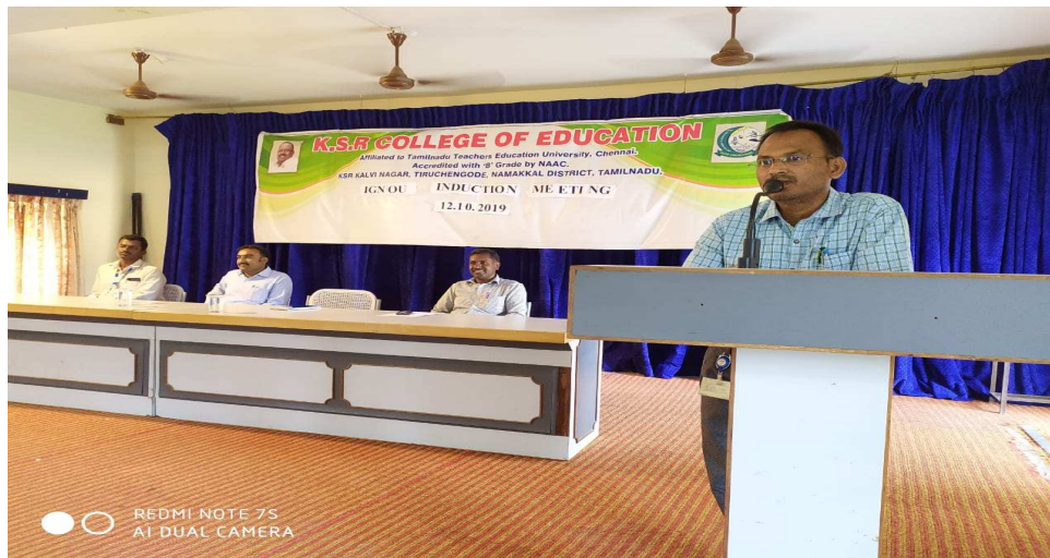
Coordinator of LSC-2564 KSR College of Technology, Tiruchengode addressing the learners during Induction Programme

During induction programme he explained about importance of ID Card, Checking the registration Status, going through the website, importance of attending the counselling sessions for theory and practicals, reminding the certificate and semester based programme students to submit the assignments on or before 31-10-2019 and submit online examination form on or before 20-10-2019 without late fee. And also instructed all other learners to submit the assignments in the month of March and submit online examination form in the month of March without late fee. The Coordinator thoroughly explained about evaluation system.