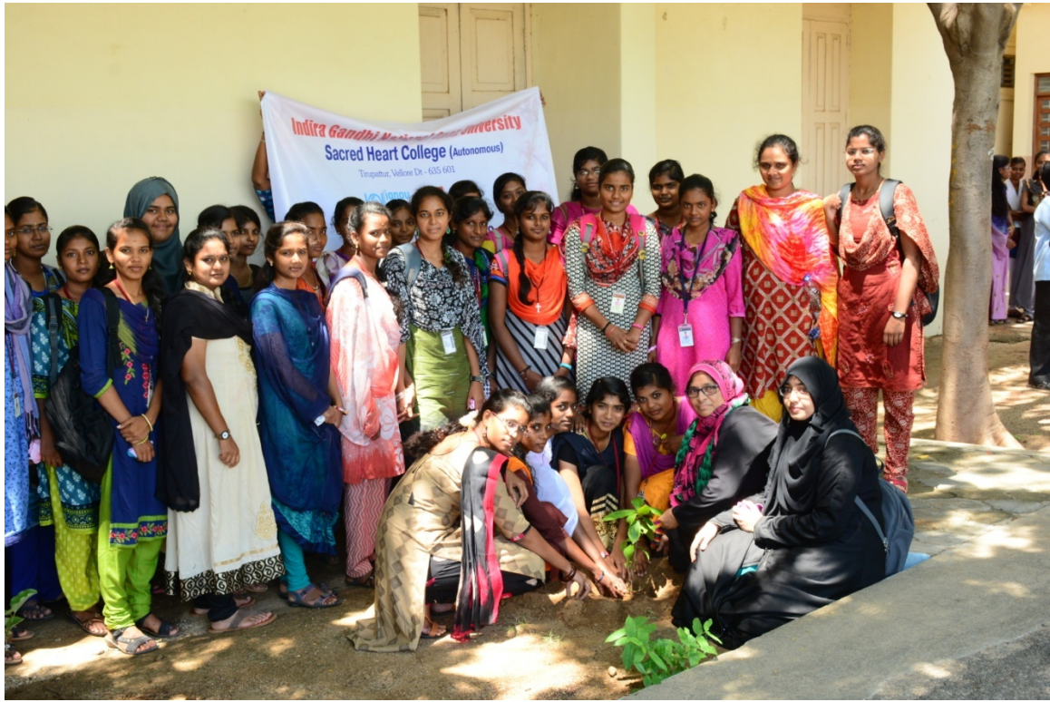
Plant a Tree Programme at LSC-2509 during Induction Programme