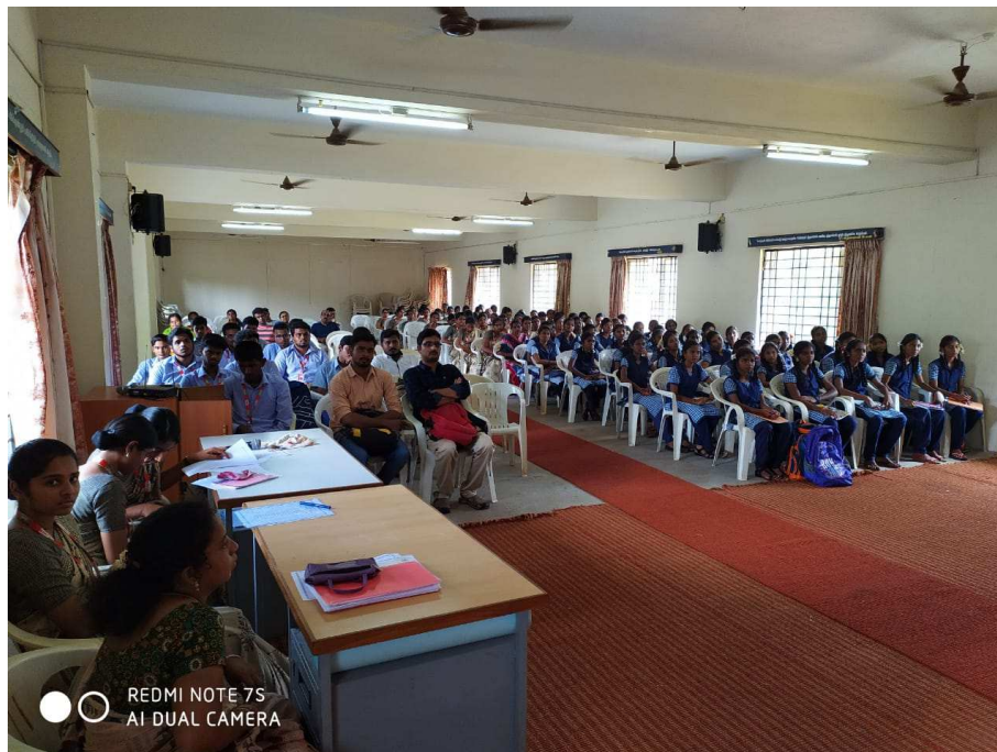
Learners attending Induction Programme at LSC-2564 KSR College of Technology, Tiruchengode