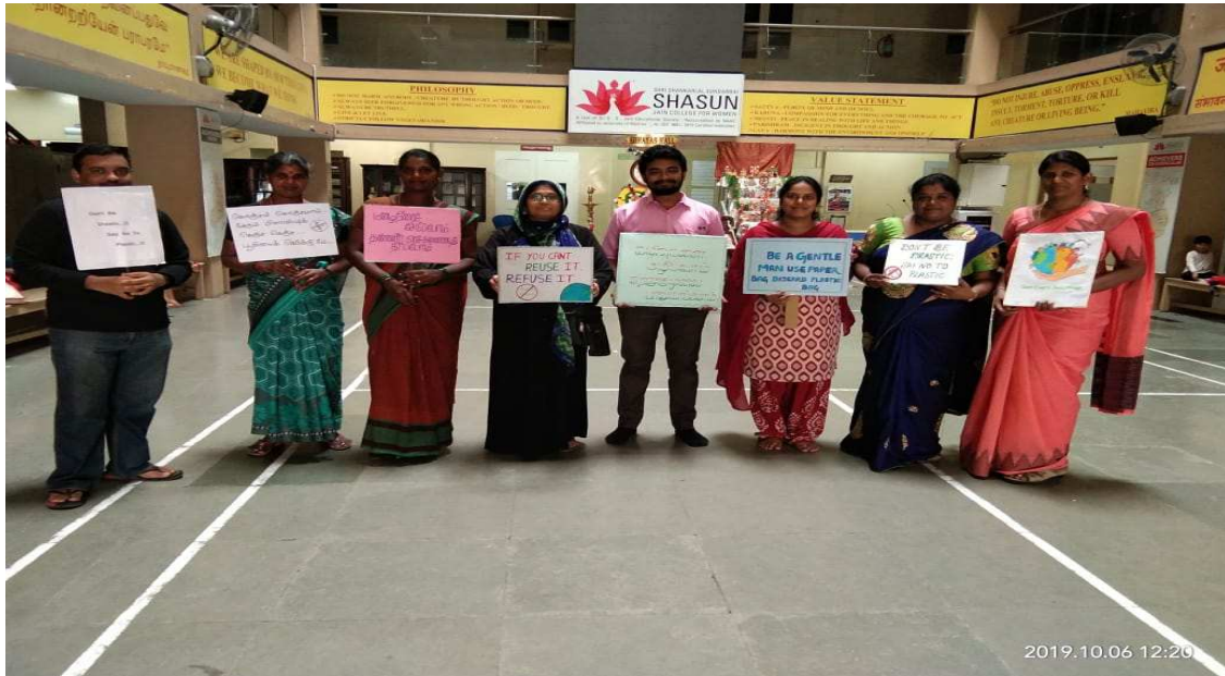
Creating Awareness on Plastic Free Environment at LSC-25160, SSS Jain College, Chennai along with Induction Programme